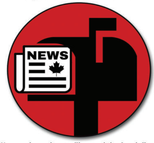
Never miss an issue with a postal subscription. Just cover the cost of s/h.

Have your Druthers delivered right to your door each month.