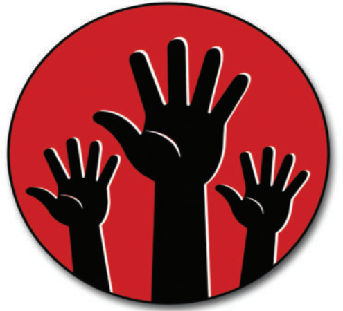
Or maybe you can help in other ways? We'd love to hear from you. Visit us at: druthers.net/volunteer

Your support is vital to the continued success of this paper.