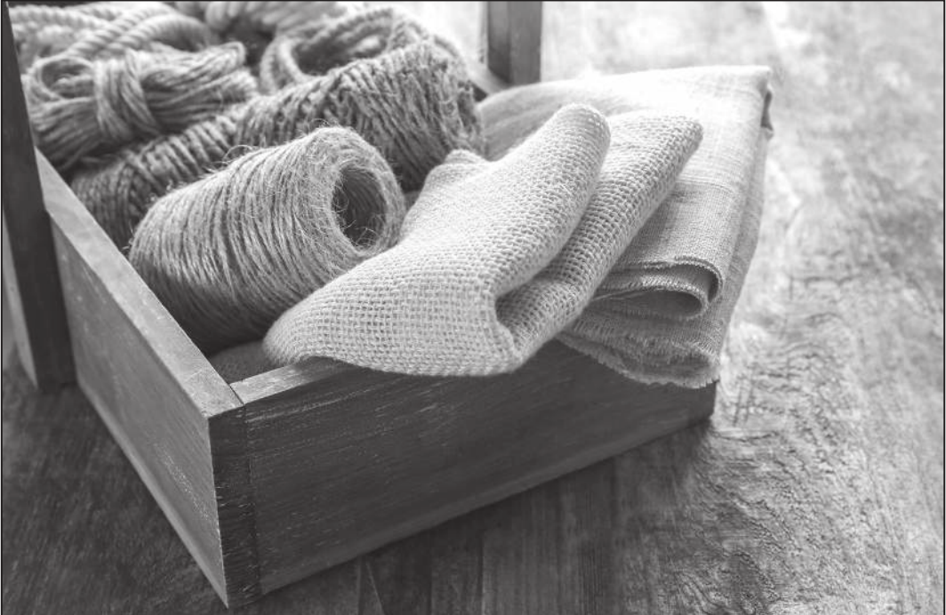
Twine & fabrics made from the hemp plant.

It’s not about the money. It’s never about the money. Or is it? Government, at the behest of vested interests, was telling farmers they could not grow an essential farm crop on their own land. Farmers could not grow their own baling twine, rope, and clothing and had to buy replacements, often from offshore. They had to grow another crop for chicken feed and lamp and fuel oil, etc. A cash crop to pay taxes and mortgages was gone, or fines or jail or land confiscation awaited.