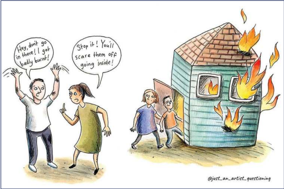
This must be how the vaxx injured feel when trying to warn others (Art by: instagram.com/just_an_artist_questioning )